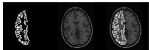
Figure 1: Cross-section of resulting cortical mantle volume (left) imposed on an MRI slice (right) for Subject 1.

Figure 1 shows a cross-section of the resulting cortical mantle volume imposed on an MRI slice for the left hemisphere of a single subject. Figure 2 shows the correlation analysis using the volume mask and the cortical mantle mask. Table 1 presents the correlation coefficient results for all subjects.